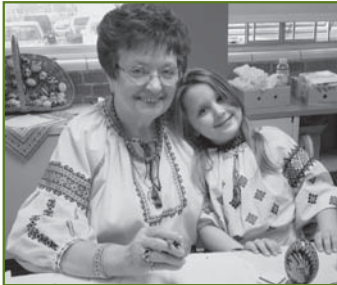
A master artist demonstrated Ukrainian egg painting.