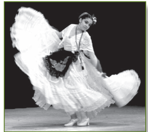
This dancer from the Mexican Folkloric Company gave an electrifying performance.