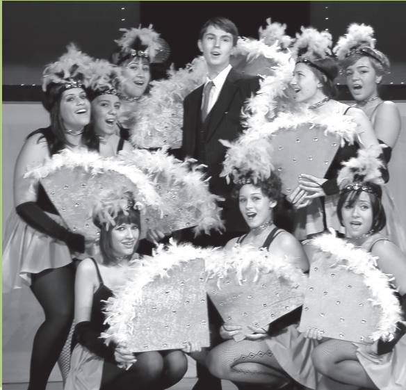
Stars of the EPHS production of "CHICAGO."

Students in Elmwood Park High School's theater program recently earned a tremendous honor: they performed their fall musical, CHICAGO , for the Illinois High School Theatre Festival at Illinois State University in Bloomington! Each year, throughout the first full week of January, over 4,000 high school students from across Illinois attend the festival to meet other students in the dramatic arts, attend workshops and see student performances. Among this year's nearly 70 student presentations, the EPHS production of CHICAGO was one of the few full-length productions selected by festival representatives to be performed in its entirety.