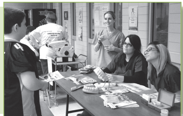
The district's first Health and Fitness Jamboree was a great success! See story on page 3. (Right): At the Health and Fitness Jamboree, representatives from one of the many participating health-related businesses provided information on dental health.