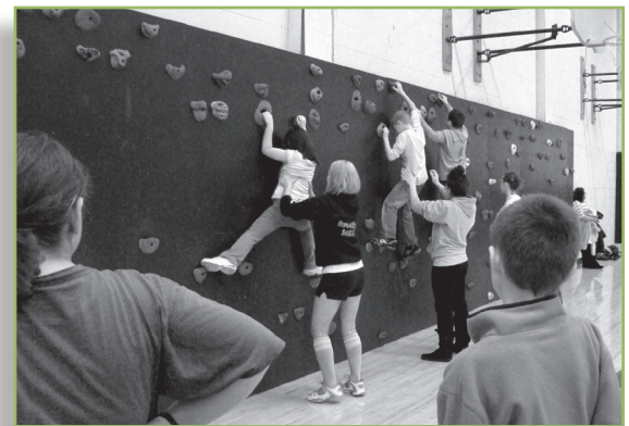
A climbing wall was among one of many Health and Fitness Jamboree activities.

Hundreds of community residents flocked to the district’s first Health and Fitness Jamboree held at Elmwood Park High School on the evening of March 10. There, they discovered an abundance of health-related information presented by local healthcare providers, dentists, chiropractors and nutritionists. Attendees had the opportunity to participate in athletic and fitness activities such as scaling a climbing wall, doing pull ups, shooting hoops, playing field hockey, riding a stationary bike and more. They could watch performances and presentations from dancers, martial artists, wrestlers, a professional jump roper, and others. Young children especially enjoyed the inflatable moonwalk castle and slide that was among the evening’s highlights. Parents also had the opportunity to learn about the many athletic opportunities available to Elmwood Park High School students.